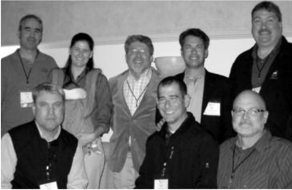
Above: The San Francisco Bay Area chapter 2012 board at the Leadership Conference.